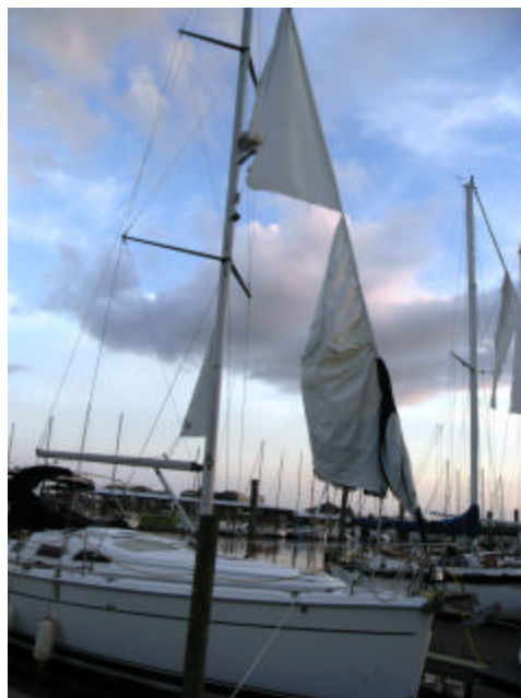
— A common site in the Marina after Hurricane Humberto passed through..

(live cameras, panama canal) http://www.pancanal.com/eng/photo/camera-java.html