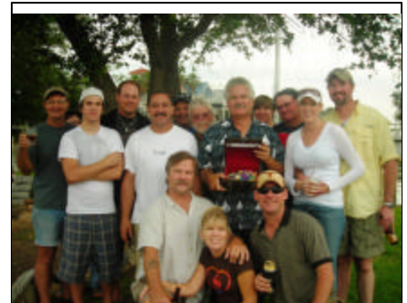
The winners from the Treasure Hunt back in May 2008