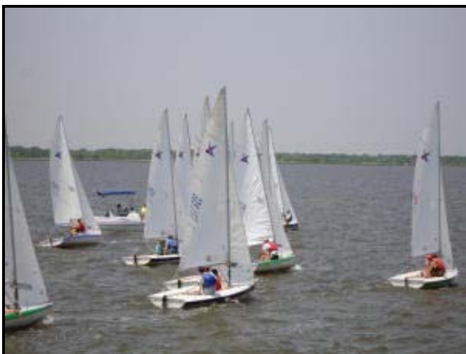
Eleven V15s participated in the 2005 Southern Circuit Pleasure Island Extravaganza on August 6-7, 2005.