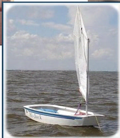
Hijack without its skipper(taken at Jack’s memorial service)